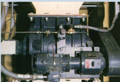
Ceramic-lined Rotary Feeder